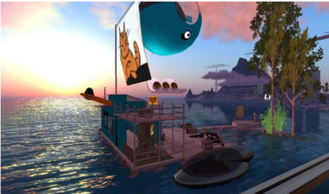
Chris Marker's virtual home on Second Life, May 29, 2009.