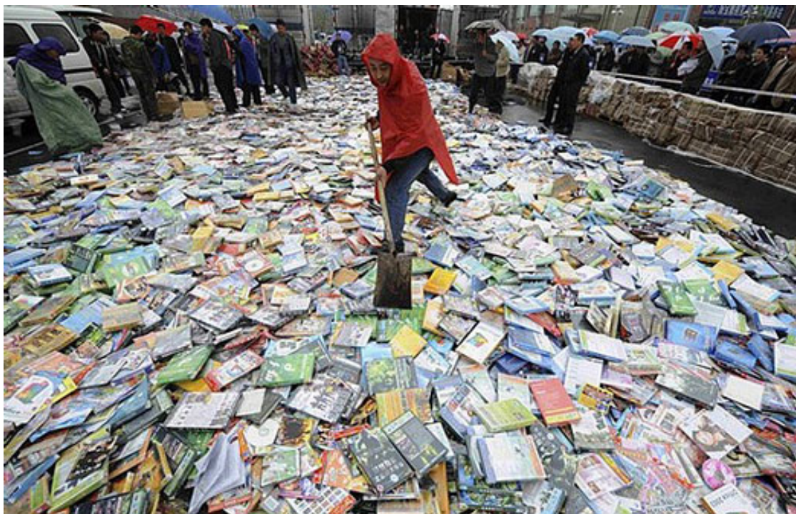
Shoveling pirated DVDs in Taiyuan, Shanxi province, China, April 20, 2008.

capitalism. Poor images are dragged around the globe as commodities or their effigies, as gifts or as bounty. They spread pleasure or death threats, conspiracy theories or bootlegs, resistance or stultification. Poor images show the rare, the obvious, and the unbelievable—that is, if we can still manage to decipher it.