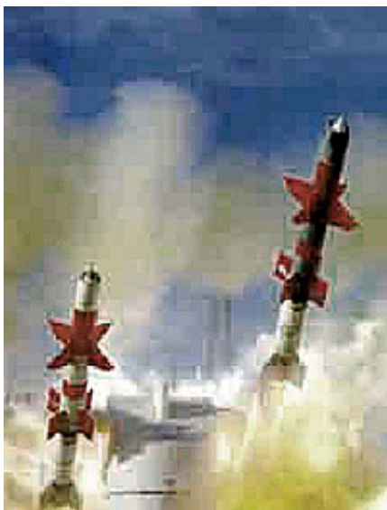
Thomas Ruff, jpeg r1104 , 2007.

into the swirl of permanent capitalist deterritorialization. 13 The history of conceptual art describes this dematerialization of the art object first as a resistant move against the fetish value of visibility. Then, however, the dematerialized art object turns out to be perfectly adapted to the semioticization of capital, and thus to the conceptual turn of capitalism. 14 In a way, the poor image is subject to a similar tension. On the one hand, it operates against the fetish value of high resolution. On the other hand, this is precisely why it also ends up being perfectly integrated into an information capitalism thriving on compressed attention spans, on impression rather than immersion, on intensity rather than contemplation, on previews rather than screenings.